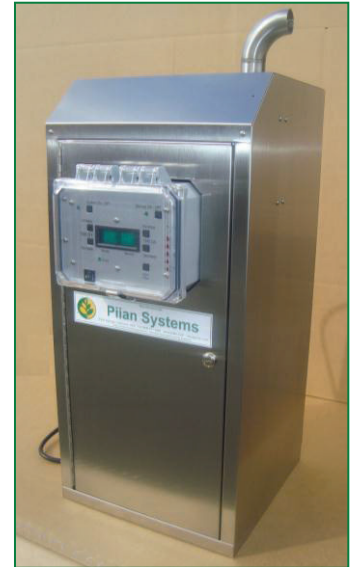
Piian Mini Vaporizer

The Piian Mini Vaporizer was developed by us over 10 years ago to solve the performance problems and high service costs of perfume sprayer type systems and the hidden electrical costs and safety issues associated with ozone generators.