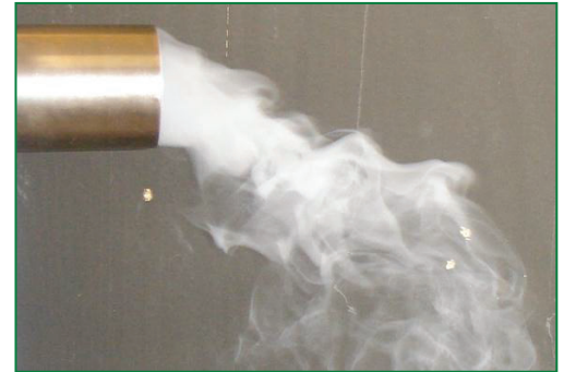
Piian Odor Neutralizing Vapor

Piian Odor Neutralizer has been independently tested and complies will all federal safety standards.