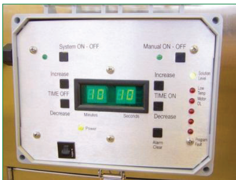
Piian Digital Control Panel

Built using stainless steel and Lexan materials and industrial quality components our system is tough and reliable, with only one moving part it has virtually no maintenance requirements and will provide years of trouble free operation in freezing, high UV, wet or high humidity conditions, indoors and outdoors.